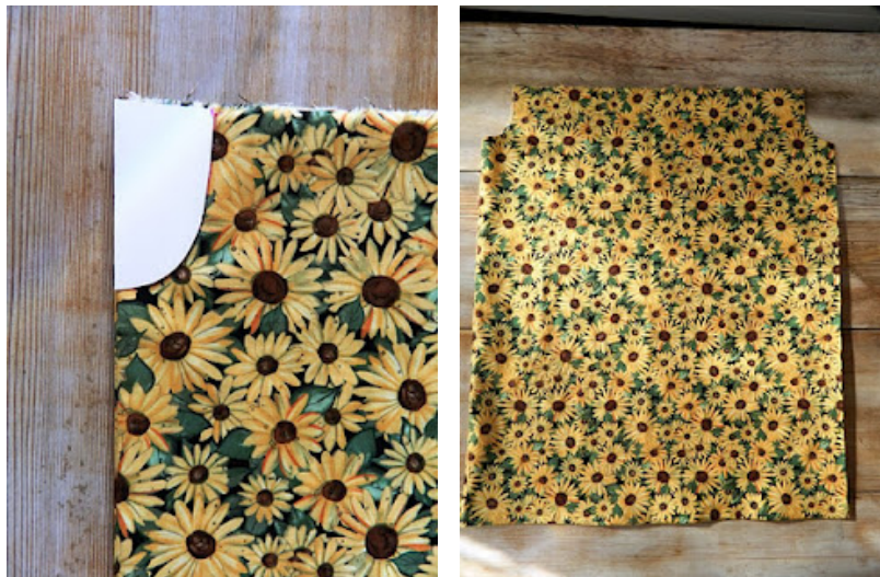
Trace and cut your arm openings. Your fabric should look like this.

You should now have a tube of fabric with a hem on one end. Lay your tube out flat with the seam on the side rather than down the back. It will be much less noticeable and both the front and back will appear seamless. Use the appropriate size ARMHOLE template to cut out the armholes.